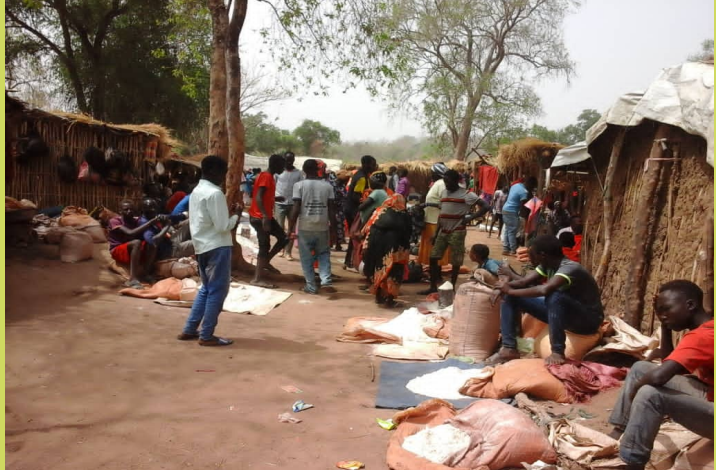
A market in Yabus, Blue Nile (March 2021)