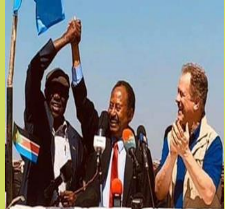
SPLM-N faction leader Abdelaziz Al Hilu and Sudan's Prime Minister Abdullah Hamdok hold their hands in Kauda, as WFP chief David Beasley looks on.