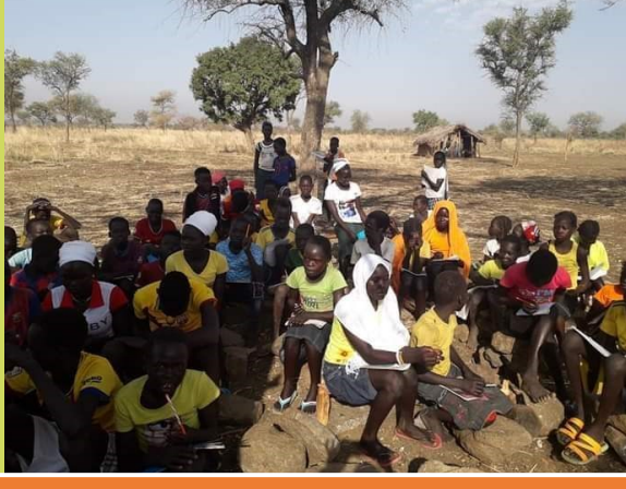
Pupils attending lessons under a tree at Beeh Primary School - Chali, Blue Nile