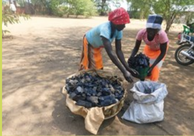
Woman selling charcoal in the Blue Nile, May 2021