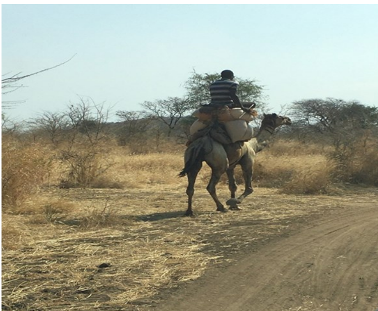
A trader transporting food commodities to the market in South Kordofan, February 2021