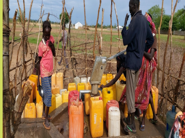
One of the water points in Blue Nile (April 2021)