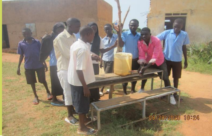
Hand washing station at Sada Primary School, Western Jebel (October 2020)