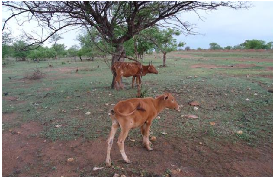
Sick cattle in Karakaraya village, Umdulu Payam, Um Durain County (October 2020)

There are continuous reports of livestock mortality across the region. In October, the County Secretariat of Animal Health registered ( 250 heads of cattle, 311 goats and 85 sheep) death in Tangal and Seraf Eljamous Payams of Um Durain County. Livestock sector contributes to food security basket for most households across the region. Urgent intervention in terms of veterinary drugs, vaccination and veterinary training is needed.