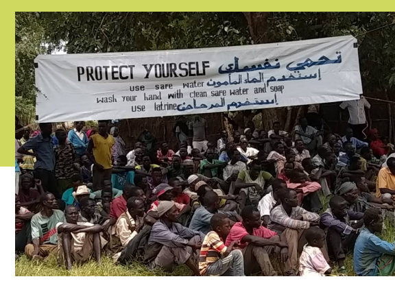
Cholera Awareness Session Blue Nile

Migration of households into the monitored areas from the rest of Sudan and refugee camps in South Sudan, as well as internal displacements continues. Movements of people seems to be mostly correlating with severe food insecurity. Movements from Ethiopia and South Sudan continue across the border, with reports of people from Maban, South Sudan crossing into Ethiopia each week. These are mainly students and people affected by food shortages in Maban, and access to health & education services.