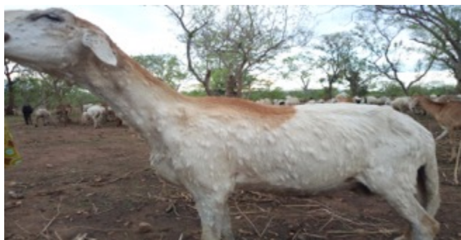
"Jethery or small fox-like disease"

An animal vaccination campaign has been successfully completed in the central region of South Kordofan. Nonetheless, just as reported in the March Update, animals are affected by the Tasamom and Buzagala diseases, now in Western Kadugli and Delami County, with reports of cattle dying of the diseases. In Blue Nile, an affliction locally described as Jethery or small fox-like disease has been affecting sheep (see picture below). The absence of consistent veterinary services in the Two Areas is an ongoing risk for spreading diseases without control, also into neighboring government-controlled areas.