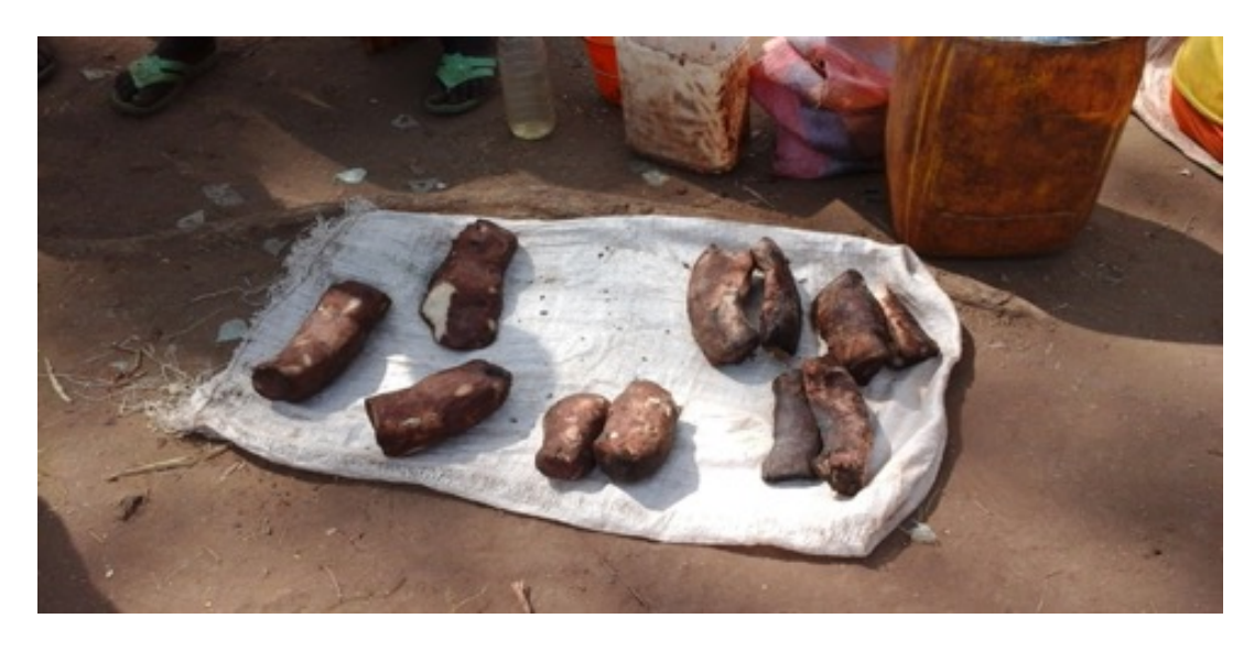
Wild fruits are the only available food in Komo-Ganza in January 2019.

The vulnerability of communities has increased due to the economic decline, and the <u>risk factor for humanitarian disaster</u> is going up.